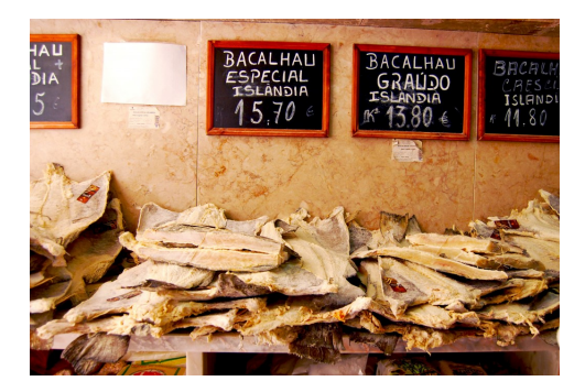
Fig. 1. An image and its corresponding captions